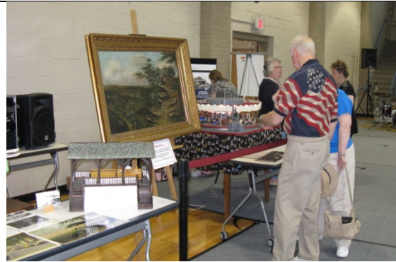
One Mountain Foundation memorabilia.