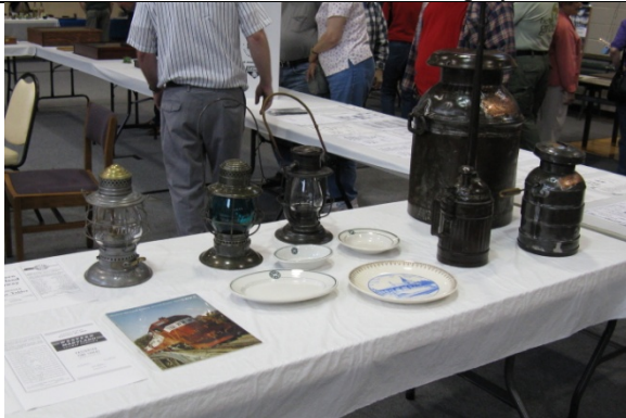
Western Maryland Railroad memorabilia.