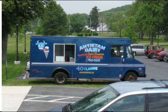
Antietam Dairy Ice-Cream.

Food and refreshments on sale by the Sons of the American Legion Post 239.