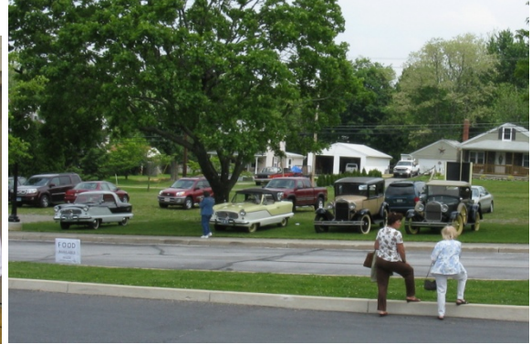
Antique car display