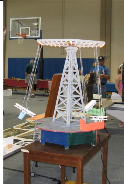
Model of Seaplane Ride.